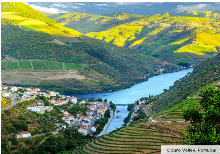
Douro Valley, Portugal