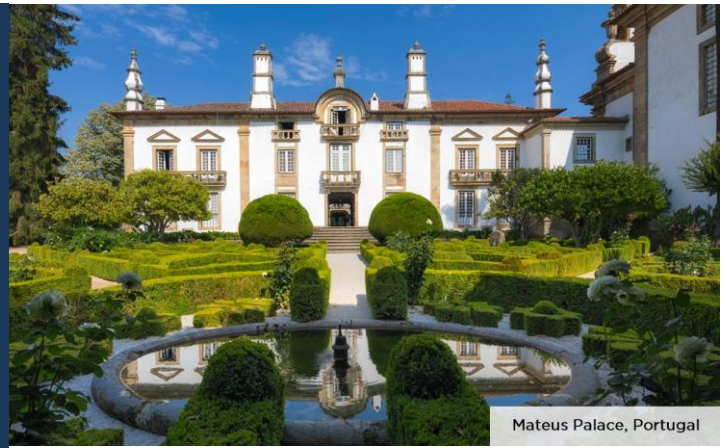
Mateus Palace, Portugal

7-night cruise from Vila Nova de Gaia (Porto) to Vega de Terrón August 22-28, 2026 | AmaVida