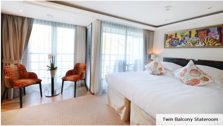
Twin Balcony Stateroom

14-night cruise | May 15-June 2, 2025 | Aboard AmaVerde